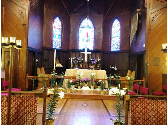
Easter Sunday April 4, 2021