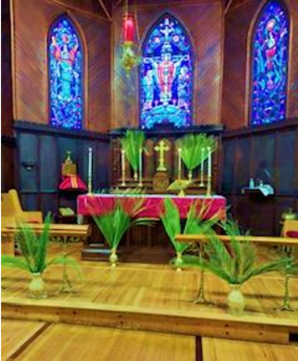
Palm Sunday March 28, 2021