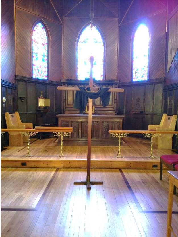
Good Friday April 2, 2021