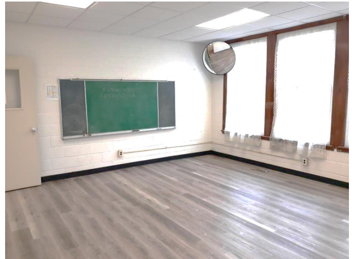
New floor in vestry room

Pentecost, Sunday May 23, regular Sunday schedule