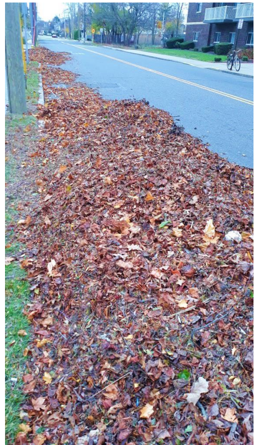
All of those leaves!