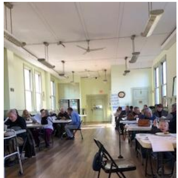
Annual Meeting January 26, 2020