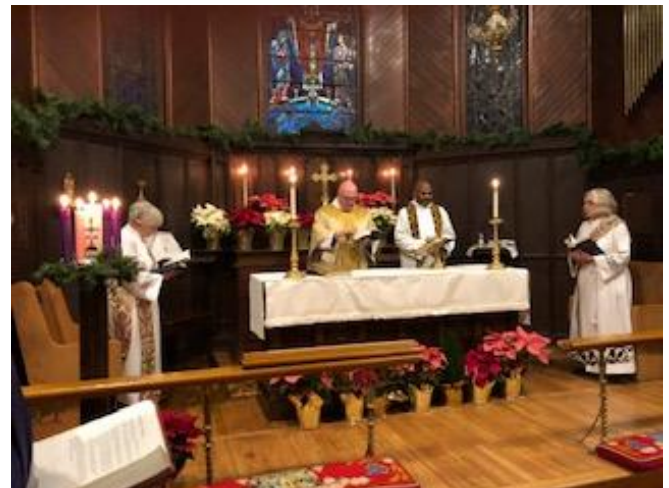
An Ecumenical Epiphany: Christ Church, Bellport, St. James Brookhaven, Our Savior, Lutheran graced our altar for Epiphany