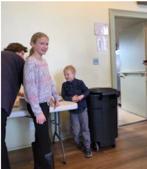
Acolytes get ready to cut the cake