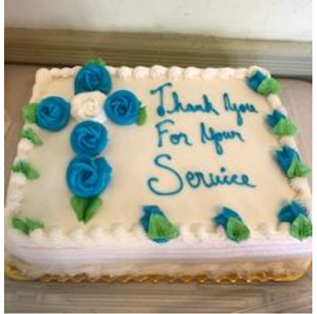
Cake for the Acolytes