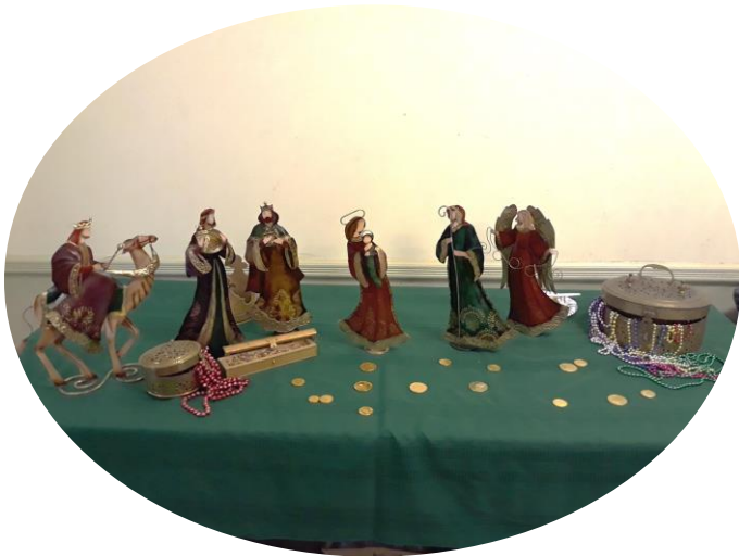
Three Kings Decorations and Crowns courtesy of Conni Still