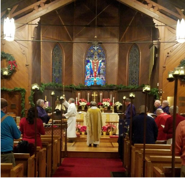
Christmas Eve 2019