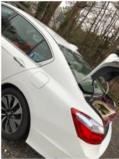
Car filled with Adopt A Family Gifts