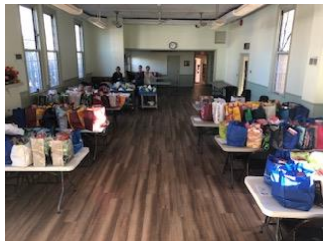
Thanksgiving Donation Bags 2019