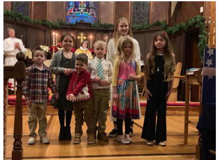
Christmas Eve Pageant Participants