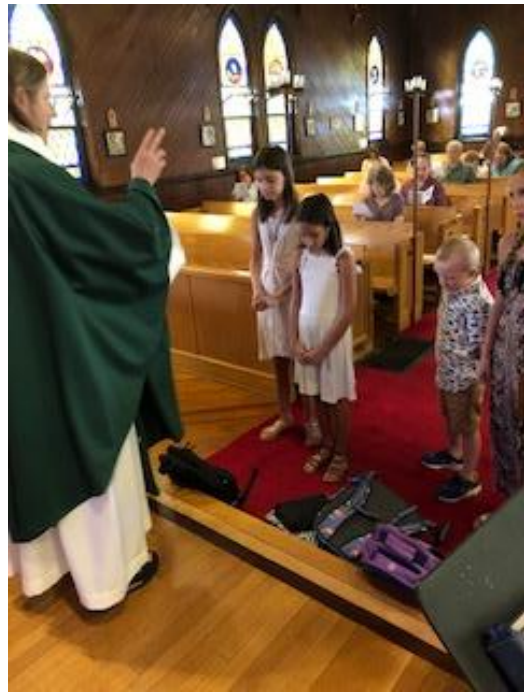
Blessing of the Backpacks