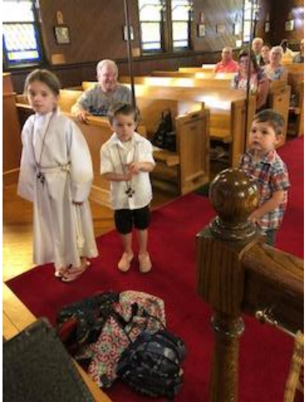
Blessing of the Backpacks

November 16, 2019 Dia De Los Muertos, watch for bulletin announcements