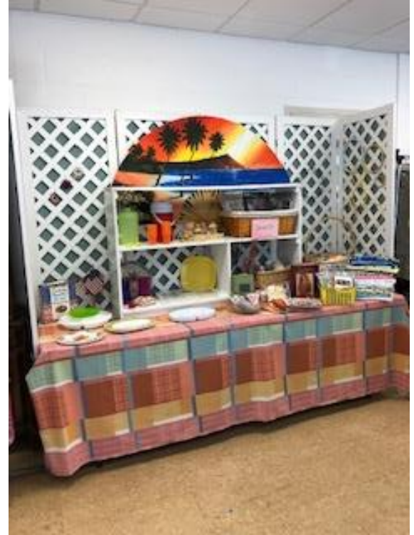
Thrift Shop Summer Specials and Crafts!