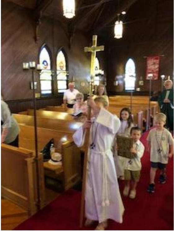
Acolytes all had new assignments.