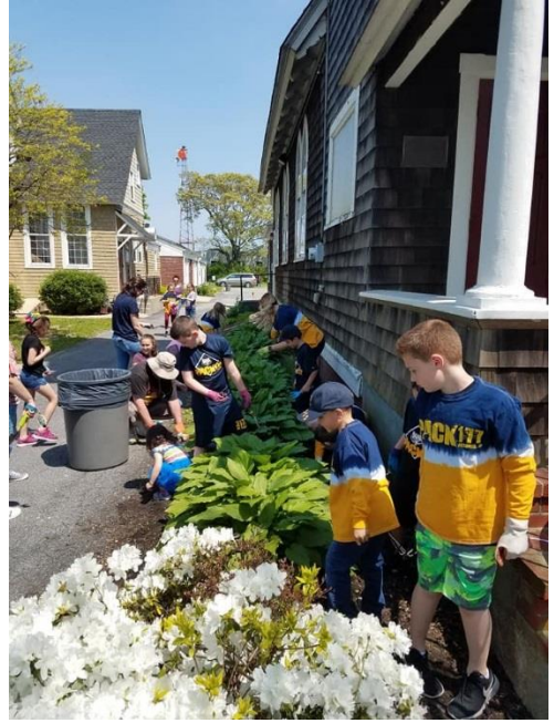
Pack 177 Spring Planting