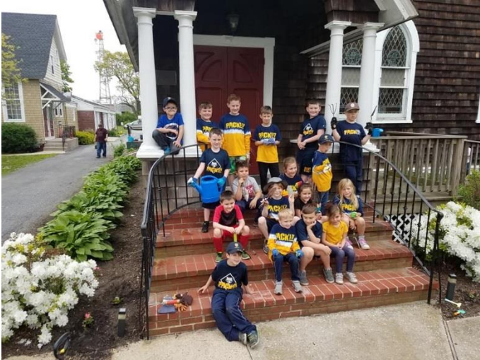
Pack 177 Good Job Well Done