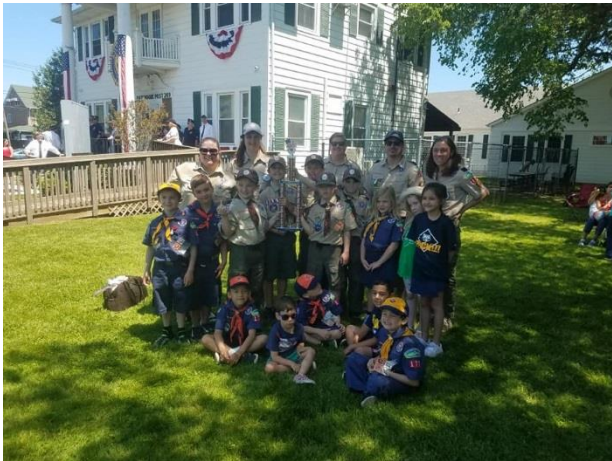
Pack 177 won Best Unit in the Memorial Day Parade. Congratulations!