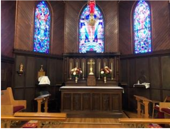
The altar is set against the back wall as it would have been 175 years ago.