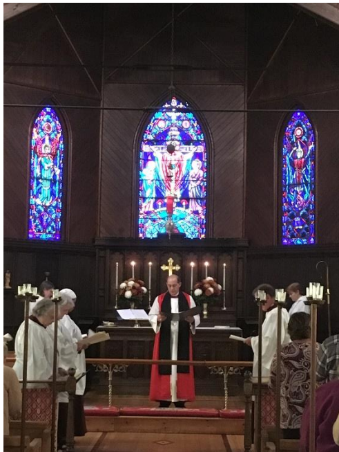
The Bishop wore vestments similar to those worn when the church was built.