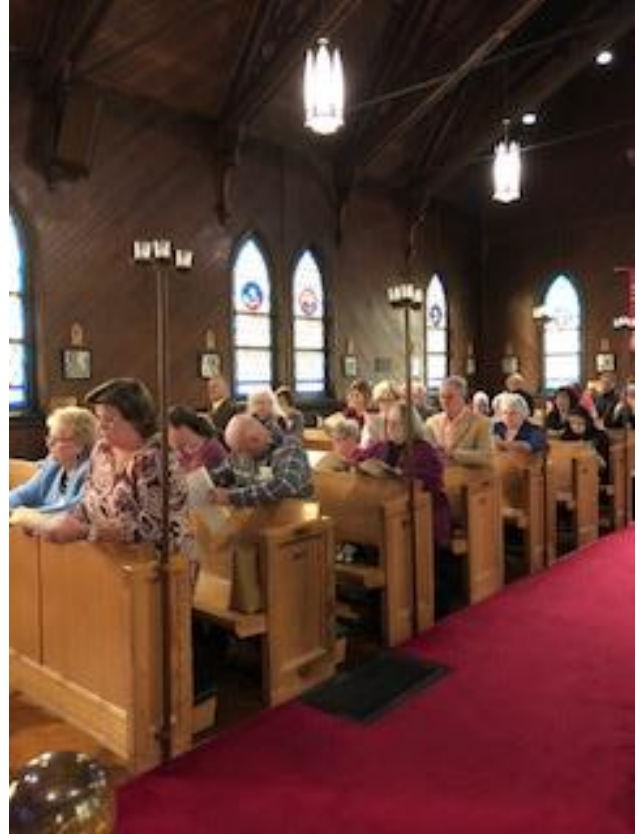
A Full Church!

December 1, 2018: Christmas Vendor Fair, bring your friends and families!