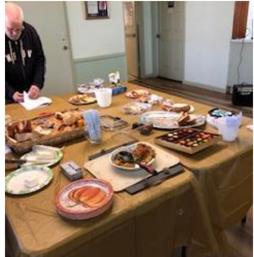
Annual Meeting Brunch