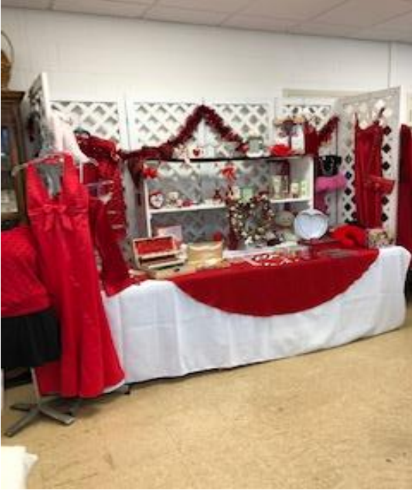
Valentine's Day Specials in the Thrift Shop