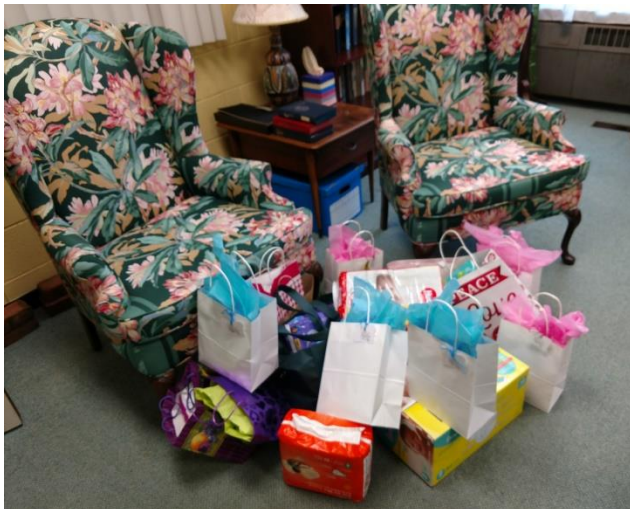
Gifts for Mercy Center Ministries