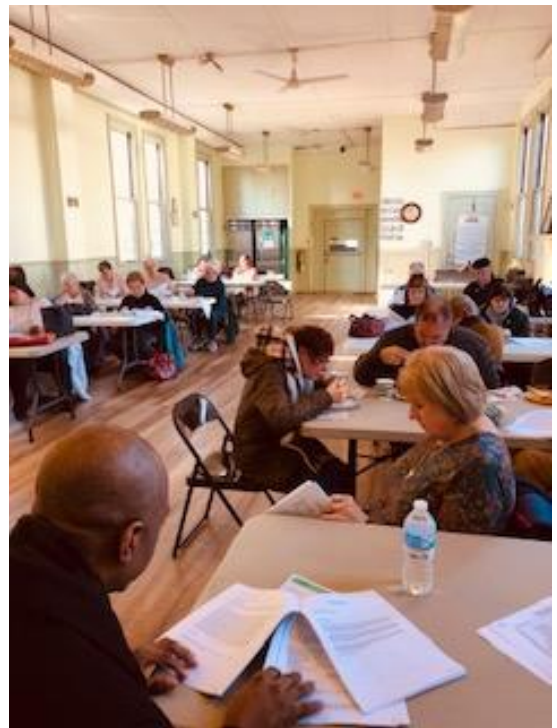
Congregation at the Annual Meeting study the Proposed budget and reports. Great picture of The new floor!