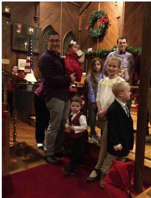
Bringing the animals to the manger is a favorite part of the Family Service for the children.