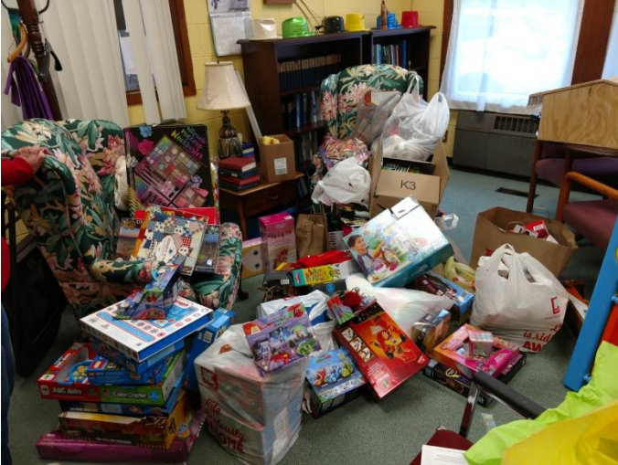
Toys for St. John's Hospital