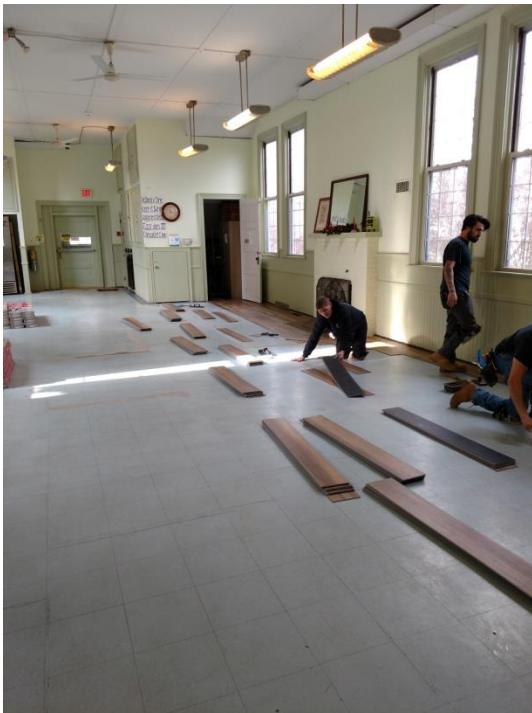
New flooring for Phipps Hall